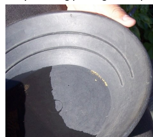
Gold Photo by Steve Lewin